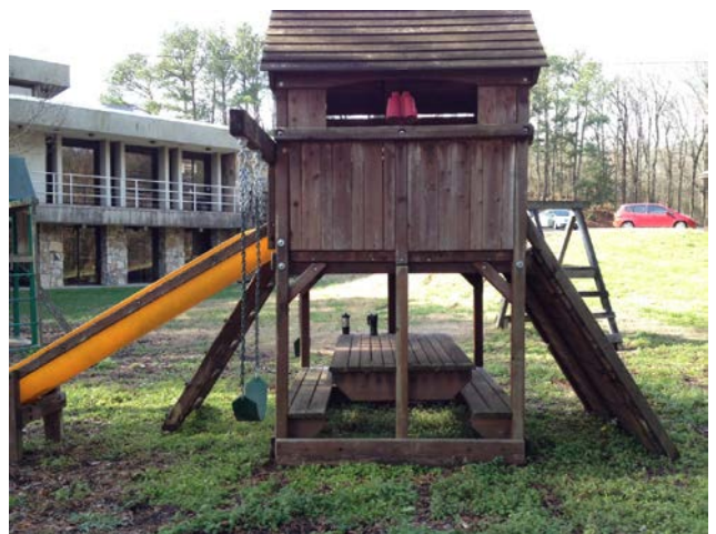
Above: New playground equipment